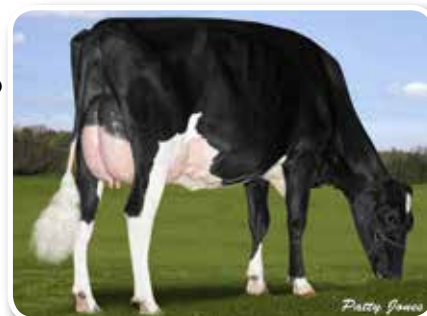
GlenIslay Unix Frozen VG-86 2YR Daughter of Unix

He is another strong Immunity+ option to reduce your herd's disease incidence rates along with sound functional traits including 106 Calving Ease and 105 Milking Speed. Unix daughters will contribute willingly to the bulk tank as well, as he scores +1232kgs milk. Unix packages Immunity+ with extreme Type and great production to produce long living, profitable cows.