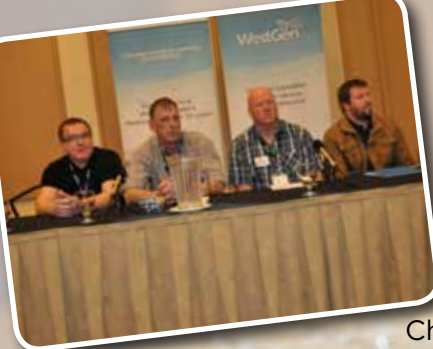
each giving a description of their farms and