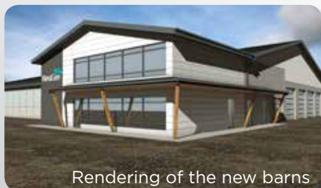
Rendering of the new barns