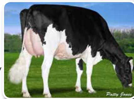
Claynook Divinity Unix VG-85 2YR Daughter of Unix

Croteau Lesperron Unix dazzles with phenomenal proven type figures after getting his long awaited progeny proven numbers. Popular as a Genomax sire, Unix is sure to see his popularity grow even higher after an incredible proof round landing him as the #1 type bull in Canada at +17 conformation. Truly an udder expert, Unix leads all proven sires with +17 for Mammary System.