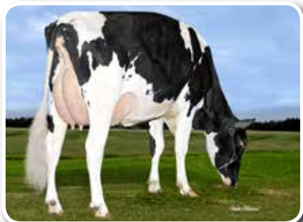
Jobert Lautrust Erika VG-86 2YR Daughter of Lautrust

Comestar Lautrust makes his phenomenal debut, dominating proven sires with an extremely balanced proof. The only proven sire above 3300GLPI and 2400PRO$ at the same time; he rounds off his highly profitable production numbers with +14 Conformation. Comestar Lautrust daughters have outstanding, soft, well attached udders. With an enviable +11 rump score Lautrust lowers pins, and improves thurl placement.