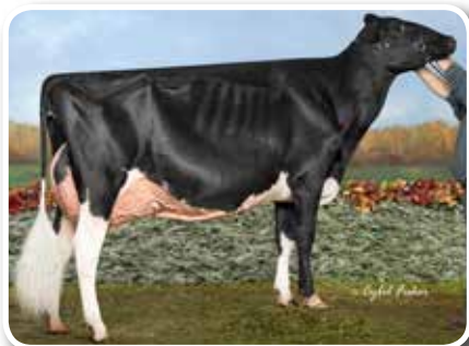
Comestar Lamadona Doorman VG-89 2YR Doorman sister to Lautrust

An exceptional settler, he gains our Repromax badge for his desirable semen fertility. Lautrust comes from the time tested Comestar Laurie Sheik cow family. His Man-O-Man dam has already shown her transmitting ability on the female side with offspring like Comestar