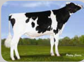
Boldi V APTITUDE Davinci x Epic

Now available and still tops for Conformation in Canada at +18. His 3144 LPI and 2120 Pro$ are pretty respectable too!