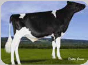
Norca Silky ALONZO Mascalese x Dempsey

Now available and still tops for Conformation in Canada at +18. His 3144 LPI and 2120 Pro$ are pretty respectable too!