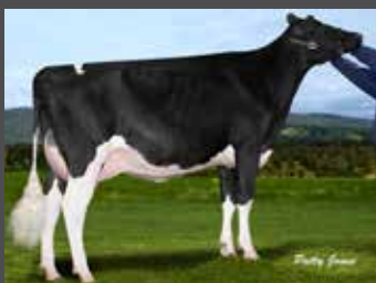
Elmbridge Goldwyn Darling VG-88-3YR-CAN 4*