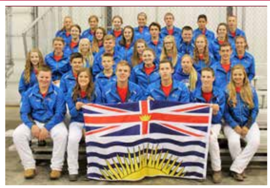
Team British Columbia