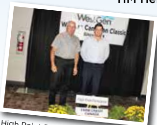
High Point Participant