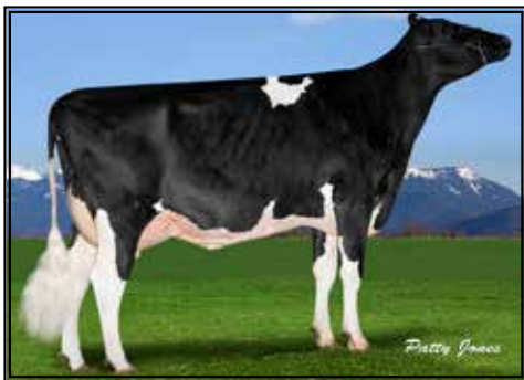
Tuytel Meridian Locklynn VG-86-2YR-CAN