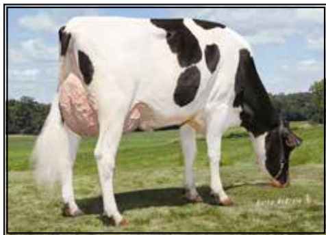
Ms-Golden Oaks M Calypso VG-87-2YR-USA

On August 11 th , his initial proof was released and it included production records from nearly 500 daughters and conformation data from close to half that many. With 2868 GLPI, he landed at #18 on the list and is one of the most balanced bulls available for production, durability and functional traits. Highlights of his proof include 2006kg of Milk, 52kg of Protein, 13 for Conformation and Mammary Systems, 10 for Feet & Legs, 104 for Daughter Fertility, and 106 for Calving Ability. As his genomic index had predicted, he should be protected for Fat %. As a Repromax sire, he's often noted for his superior settling ability. This makes him a great choice to include in your breeding program as you look for fertile bulls to settle cows this fall that were affected by summer heat stress. Having made many satisfied breeders in western Canada already, and many more daughters in the pipeline, we think the story on Meridian is just beginning.