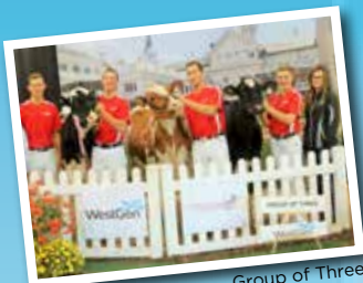
Group of Three