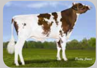
Gen-I-Beq AKYOL Red Brekem x Alchemy

Combining extreme LPI (3246) and Pro$ (2489) and solid Type (+12). Dam is a full sister to Airintake, a Genomax sire we promoted in 2014. Aptitude is our highest rated Immunity+ sire and a slightly different pedigree too.