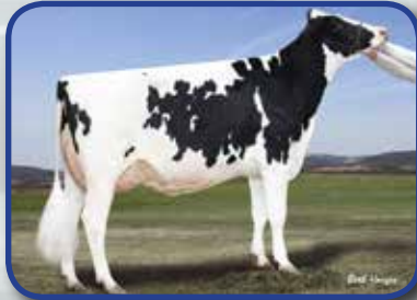
Granddam: GOLD-N-OAKS ARABELL 1765 VG-88-USA 2*

Duke's highest LPI son fits the modern ideal for commercial breeding. Very strong component production (+124 KGS Fat, +0.43%F) with an attractive 106 Daughter Fertility rating predicts hard working cows. Reducing stature, while adding lots of Chest Width, correct Rump Angle and strong udder attachments; this A2A2 sire will fit in many breeding programs.