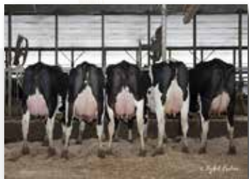
SUPERMAN daughter group

RH SUPERMAN - Supersire x Man O Man - Tracing through four generations of breeding back to Windy-Knoll-View Promise, it is amazing how a great Type family can also become a great production family. Superman combining nearly 200 kg of Fat and protein with over 2000 kg of Milk is an elite production sire. Type numbers are moderate, but he does especially well on key udder traits and for moderate-sized cows his +12 rating for Chest Width really does make one think of Superman! These are strong cows that hold their body condition despite these extraordinary production numbers. If you have a production emergency, call on Superman to save the day.