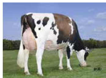
Dam: KHW-I AIKA BAXTER VG-89-5YR-CAN 20*

Gen-I-Beq ATTICO-Red - Sympatico x Baxter It's always nice to have a well-balanced Proven Red sire in our lineup and Attico-Red fits that bill. Although he just barely misses having 20 daughters past 120 days in Milk to achieve a Canadian-only production evaluation, his 225-daughter MACE evaluation is made up in equal parts of Canadian and US daughters providing a 91% Production reliability rating. Attico-Red delivers a nice shot of milk for red enthusiasts, with over 1000 kg Milk and strong fat and protein deviations. His double-digit Type rating is built on a balanced profile, matching well on many red bloodlines, lengthening teats and lowering pins. Attico, like his sire, scores well for Calving Ability.