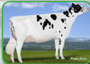
Granddam: EDG DAHLIA MOGUL 2257 GP-84-2YR-CAN

A rare combination at over 2100KGS milk and +14 for Mammary Systems this Immunity+® sire does it all. Fitting in to modern breeding programs focused on A2A2 and Robotic Milking systems this Jedi son will propel your herds in the right direction. Expect short supply until early summer.