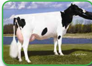
Great-Granddam: SEAGULL BAY MISS AMERICA VG-87-USA 2*

Modesty's highest LPI son, Othello is ready to add value to your breeding programs. Neatly combining big time production (2078 KG Milk, 108 KGS Fat) with appealing conformation (+13) he is especially strong for Mammary Systems (+14). Not lacking in pedigree power, he traces his family line back to the Ammon-Peachey Shauna family. Expect short supply for at least several more months.