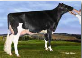
Dam: LINDENRIGHT BRADNICK MOOVIN ON VG-87-2YR-CAN 2*

market accepted with some excitement the bull Lindenright Megawatt. He was easily our most popular Genomax sire for several proof rounds due to his interesting pedigree and balanced genetic profile. The discovery of the Cholesterol Deficiency Haplotype and that Megawatt was a carrier ultimately lead to a break in his marketing, however, his early milking daughters prove the genomic predictions are for real. Megawatt sires moderate production numbers combined with an excellent Type profile, especially for Feet & Legs. He also sires a nice Health trait profile with strong Herd Life and Daughter Fertility ratings. Megawatt is a Calving Ease sire. As balanced as ever, this is an easy bull to include in your breeding program on pedigrees Optimate confirms to have low probability of HCD presence.