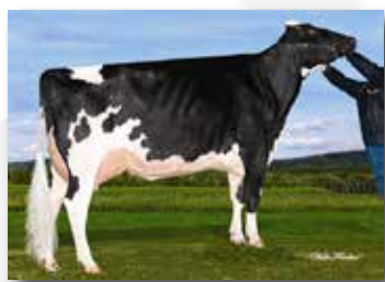
VAL-BISSON SHOTTLE IMELDA EX-91-6YR-CAN 8*

Blondin INTEGRAL RDC - Sympatico x Shottle - It's never easy to be the other brother of a #1 daughter proven LPI sire but Blondin Integral and Comestar Lineman both show it can be done with success. By the time Integral started his AI career, his brother Doorman was already siring All-Canadians and was a year away from capturing the LPI crown. Integral's proven debut at #13 position for LPI is a little less illustrious perhaps, however his claim of exceeding Doorman for both LPI and Pro$ is not too shabby. With double digit ratings for both Udders and Feet & Legs, Integral stamps a nice Type pattern in his leggy, stretchy and stylish offspring. While he is a moderate milk bull, he sires extreme fat deviations and does a very nice job of lowering Somatic Cell Score. Integral is a Red carrier and a Calving Ease sire.