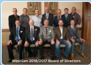
WestGen 2018/2017 Board of Directors

Today, we have a keen sense of who we are and what we will do to ensure our business continues to thrive in the future. We've never been more energised by our potential – and that potential is attainable because of the strong foundation we've built. The implementation of our 2015 Strategic Plan focused our attention and resources on performance and growth, and we can see what a difference that focus made. The results of the current strategic plan have been pleasing with all companies exceeding their strategic goals, completing both phase 1 & 2 of our construction and at the same time making impressive gains in both our equity and our cash position.