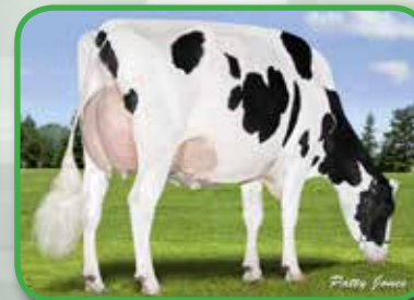
Dam: WALNUTLAWM MCCUTCHEN SUMMER EX-92-USA*

Already making a splash in the industry Sidekick only now makes it on to our proof sheet. Offering phenomenal improvements in all the major type traits including +18 for Conformation overall, +17 Fore Attachment, 0 Rear Legs Side View, and +8 Loin Strength. A rating of 102 for Calving Ability should ensure these fancy calves arrive without complications.