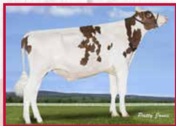
AMAZON RED Drake-Red x Pitbull 0200H011136 Conf +12

With any purchase of Dulet AMAZON RED , receive a FREE Limited Edition T-Shirt in support of Canadian Dairy Farmers!