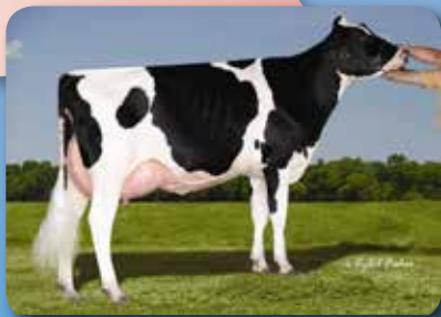
Great-Granddam: Cherry Crest Manoman Roz EX-91-5YR-USA

Siemers DARWIN - Superhero x Silver - With 95 kg Fat, +12 Conformation and the Robot Ready designation, Darwin will undoubtedly be a popular addition. He lowers pins and offers a nice balance of Heath trait improvement including mastitis resistance, Milking Speed and Milking Temperament. Darwin is among our top Genomax™ options for Rump improvement.