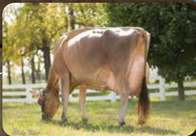
Granddam of JAMIE : Fermar Paramount Joy EX-95-USA

Guimo JAMIE – Matt x Dynamic – Bred from a sister to the very popular bull Joyride and sister to the dam of another mainstay, Judo – both who trace to the one and only Paramount Joy – Jamie is a bull all producers will want to incorporate into their breeding plans. His Sire Matt is a top ranked proven LPI sire in his own right. A nice balance of Type and Production is what you can expect from this well-bred sire.