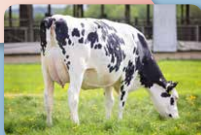
Dam: Sandy-Valley Cokiscream

Sandy-Valley CHALLENGER – Superhero x Silver – Sandy-Valley Challenger – Superhero x Silver – His 2896 TPI is our highest among bulls currently available. That rating is elite by any standard. Moderate Type is supported by a prediction for extreme Fat yield and excellent Health trait numbers. We are releasing this product with the idea that clients can make their own herds better not for our competitors to use in their breeding programs. As such you'll need to sign a contract to access semen in the early going on this bull.