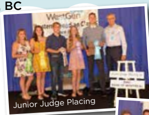
Junior Judge Placing