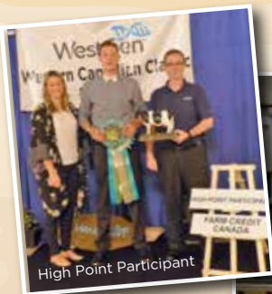
High Point Participant