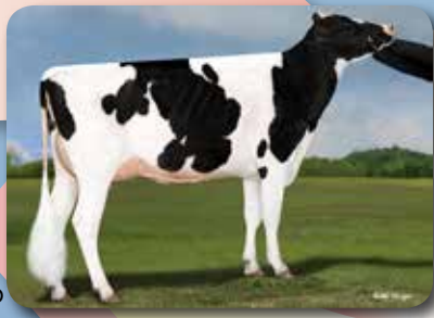
Granddam: Synergy Rubicon Perfect GP-84-2YR-USA

Progenesis PARACHUTE - Superhero x Rubicon - He's among the first sons released on what could be the industry's most prolific Rubicon daughter, Synergy Rubicon Perfect. The Superhero - Mogul bloodline cross results in a 115 kg Fat yield prediction on what are expected to be nice Typed animals with wide chested and correct Rump structure. Approaching 3500 LPI and at just over 2800 TPI and with double digit Type, this is a great balanced breeding addition to our lineup. Parachute is the Number two Superhero son for LPI available in Canada.