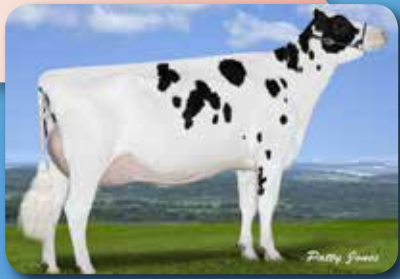
Granddam of Dropkick & Dryden: EDG Dahlia Mogul 2257 VG-86-5YR-CAN

Progenesis DRYDEN - Superhero x Kingboy - a full brother to Dropkick and although rated slightly lower for Type at +14, Dryden offers more Milk and is